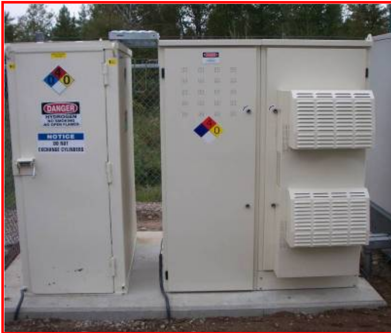
HYDROGEN STORAGE MODULE (HSM)